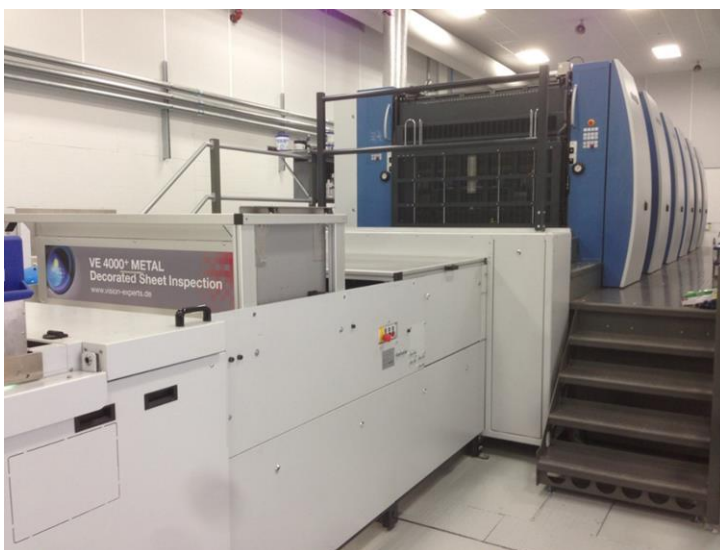
6-colour MetalStar PR with the Vision Experts inspection system VE 4000+ Metal

There are many users worldwide who are interested in a print inspection system which can be integrated into their metal decorating press. Such a system is capable of detecting not only printing flaws, but also colour deviations. It warns the operator immediately, helps to localise the source of arising problems, and facilitates timely intervention in the printing process. All quality defects are recorded in a report and affected sheets can be ejected immediately on the basis of various criteria. In case of a systematic problem, it is also possible to stop the feeder. The use of VE 4000+ METAL serves to reduce costs while at the same time improving the overall quality of the print products. Inspection systems from Vision Experts are already in successful use with many customers of KBA-MetalPrint and have earned a very good reputation through their exceptional reliability and user-friendliness.